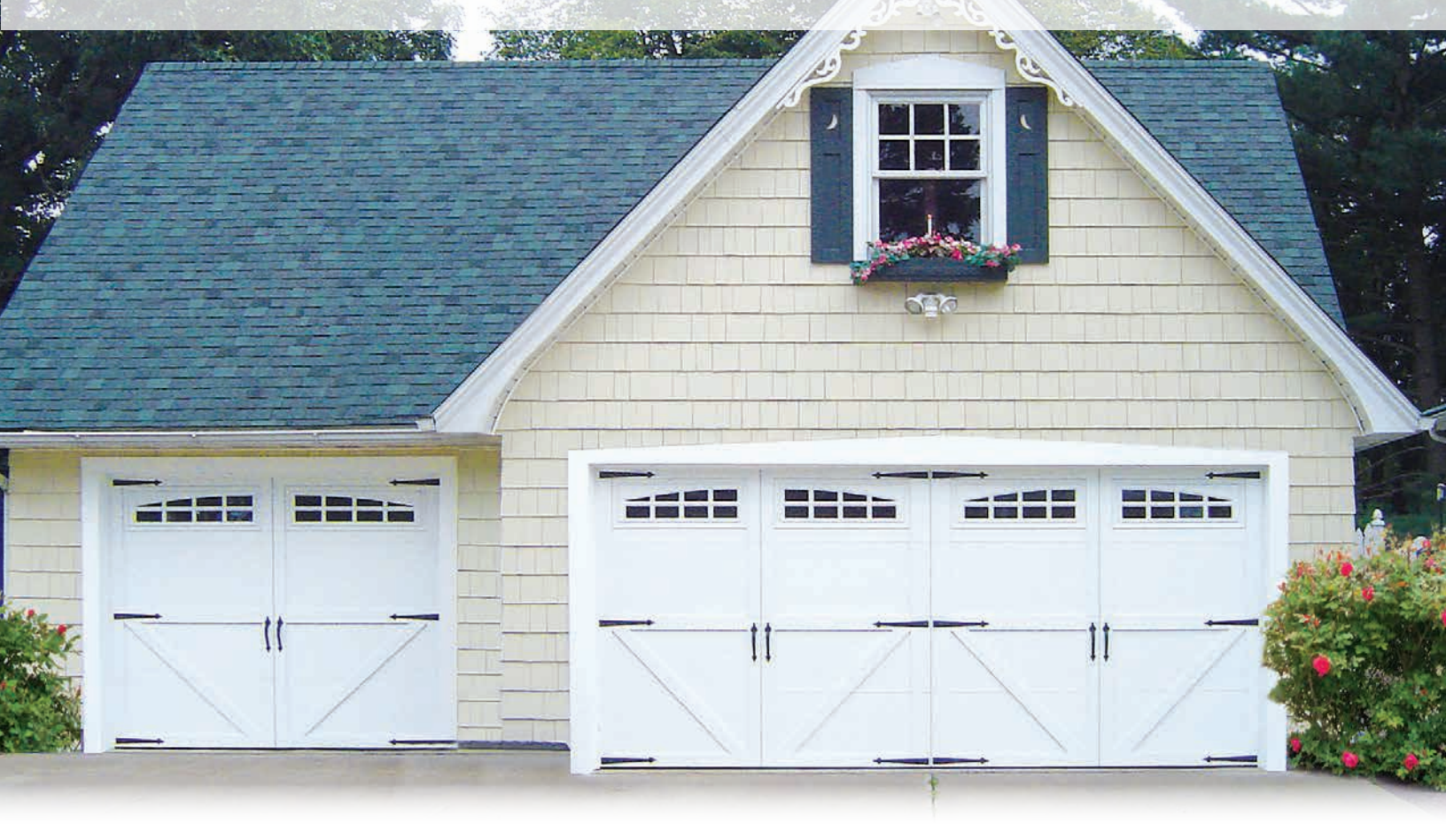
Our Courtyard Collection® features insulated steel construction, fashioned to resemble the elegant wood designs of traditional carriage house doors.